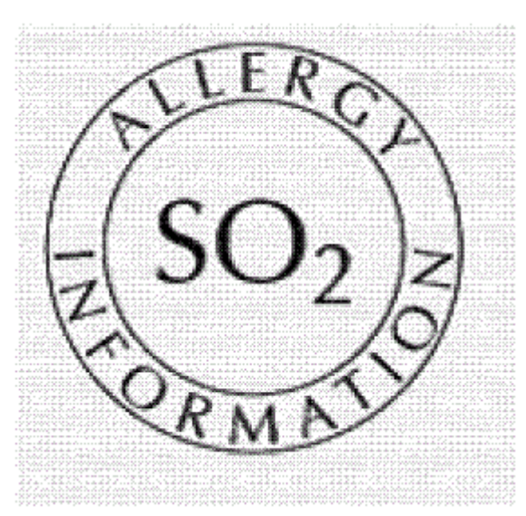
Annex No. 4